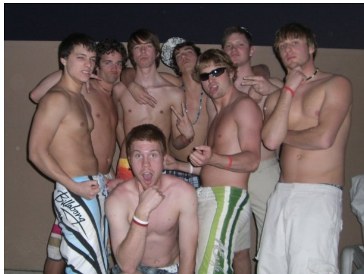
Spring Break 2008