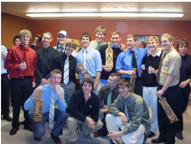
Alpha Lambda Pledge Class Initiation