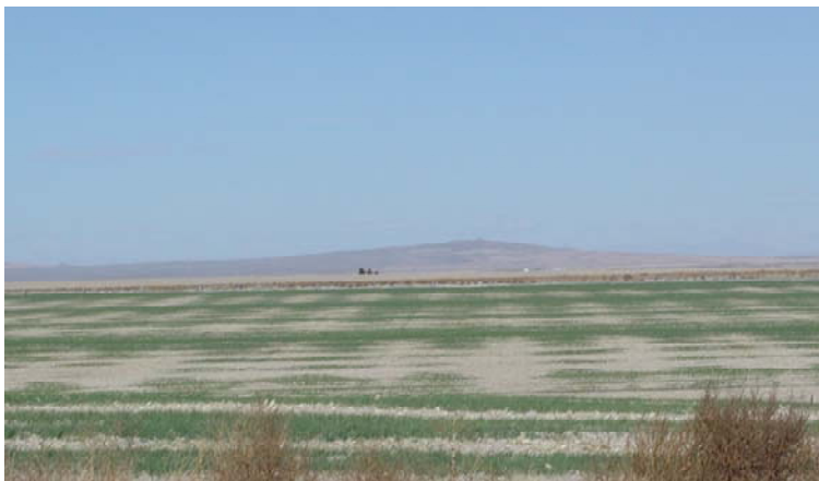
Figure 2. Poor uniformity on wheel line irrigated field.